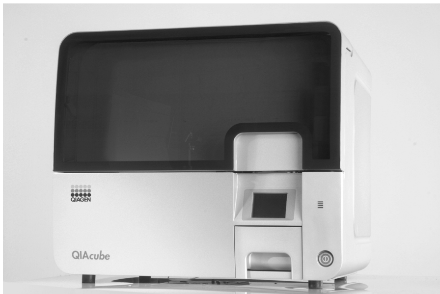
Figure 1. The QIAcube

The QIAcube is preinstalled with protocols for purification of plasmid DNA, genomic DNA, RNA, viral nucleic acids, and proteins, plus DNA and RNA cleanup. The range of protocols available is continually expanding, and additional QIAGEN protocols can be downloaded free of charge at www.qiagen.com/MyQIAcube .